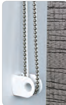
Cord and chain tensioner for vertical blinds to hold cord and chain taut