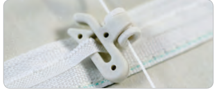
A breakaway device on the cords of a roman blind. The blind raises and lowers normally but cords will separate under undue loads