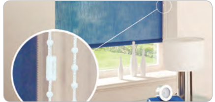
Chain break connector will part under any undue load but after inspection can be clipped back together again