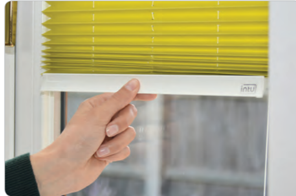
Tensioned pleated blinds have cords which are held under tension and the blind is just pushed or pulled into position