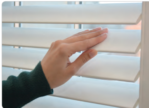
Shutters are opened and closed by hand