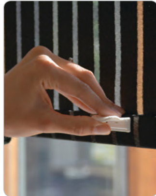
Spring operated roller blinds are operated by hand and some styles incorporate a decelerator so the blind retracts at a constant, gentle speed

There are Safe by Design options for: Roller | Venetian | Vertical | Pleated | Roman