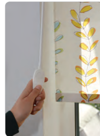
Motorised roller blinds are easy to operate and have no cords or chains. Some are battery operated too so do not need connecting to the mains