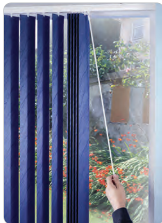
Wand operated vertical blinds are pushed and pulled into position by the wand which when twisted tilts the louvres

Always consider these blind styles first when choosing your blinds.