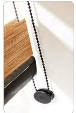
Chain tensioner to hold a single chain or cord taut